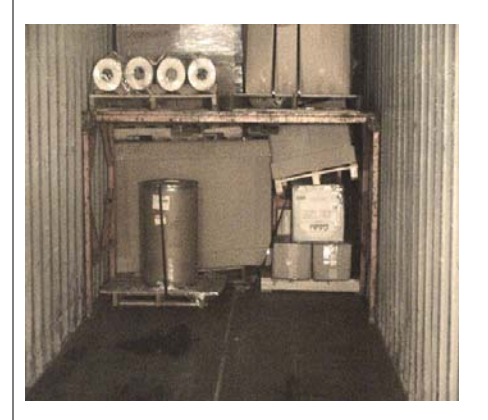
Secured freight supported by steel frame structure designed to accommodate two tier cargo stacking.