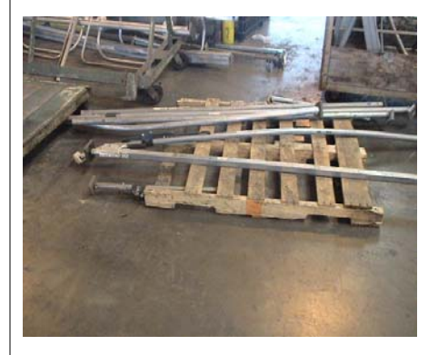
Damaged cargo bars taken out of service.

Securing loads onto a flatbed or inside a trailer also presents the potential for slipping, tripping or falling. For drivers of flatbed trailers, a common problem is the web strap or chain that comes loose or breaks when it is tightened. This usually causes the driver to lose his/her balance and fall either off the trailer or on the ground. Another hazard is having to climb on machinery to attach or route straps or chains. Without dedicated steps or footholds, a driver is at risk of slipping and falling. Inside a dry van trailer, left over pallets, loose banding or shrink wrap or cargo bars can present trip hazards.